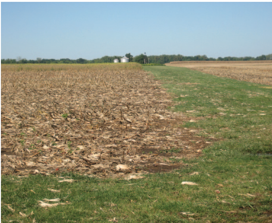
Conservationists and farmers brought different worldviews, values, and knowledge for discussions about biofuel production in central Illinois.

This PPGIS opened up an important conversation for local farmers and environmentalists. It was clear that the conservationists and farmers, while in two separate groups, brought different worldviews, values, and knowledge for discussions about biofuel production in central Illinois. This project highlighted the need to integrate