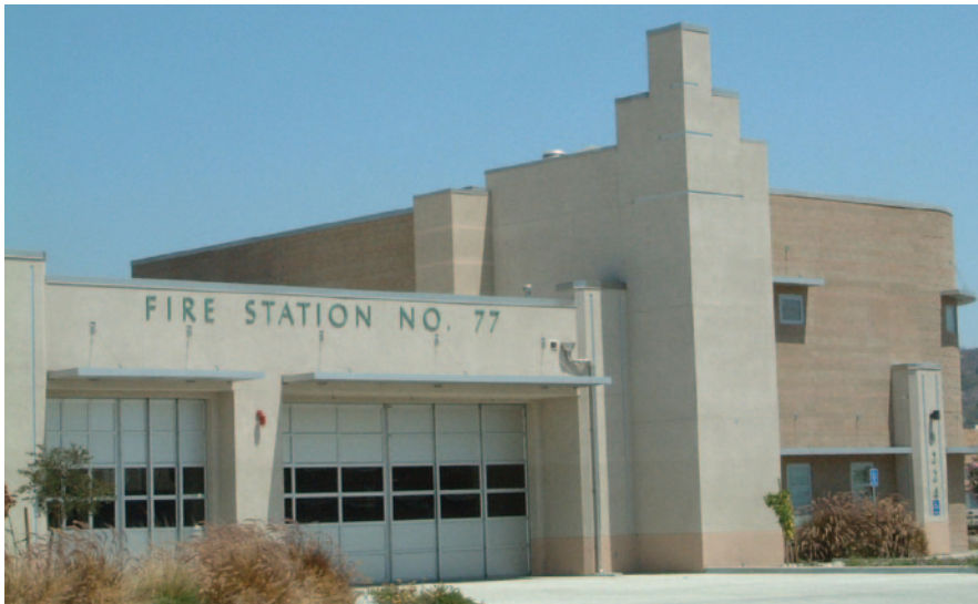
Research is being conducted to find out how local governments use different justifications to encourage or require the public and private sectors to produce green buildings, among other things.

Green buildings are hot! The construction of buildings designed to achieve high energy efficiency is increasing rapidly. Currently there are over 2,000 such buildings in the U.S., with another 10,000 under construction.