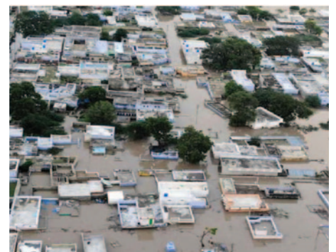
From Sean Zelenka's pop-up report: The Tungabhadra River in India overflowed in October 2009 due to monsoon-like rains, killing hundreds and displacing millions.

“public science” articles. Part of the assessment has also sought to encourage students to look into contemporary issues facing the world's river basins through a series of voluntary “pop-ups” (that gain extra credit); these are very short one- to two-paragraph articles that can be submitted each week and are based on a search of the news media online, journal papers, or the “gray” literature. All students have the opportunity to present their work as a minute-long “pop-up” talk at the start of each lecture, producing a fascinating array of information on over 50 rivers in high quality “snippets,” two of which are illustrated here. Curiosity, online investigation, and a flair for presentation have all flourished in this work—and they provide a resource on the course website that benefits the entire class.