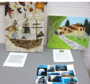
Recycled materials were used in this collage to reflect Stockholm as a sustainable city.