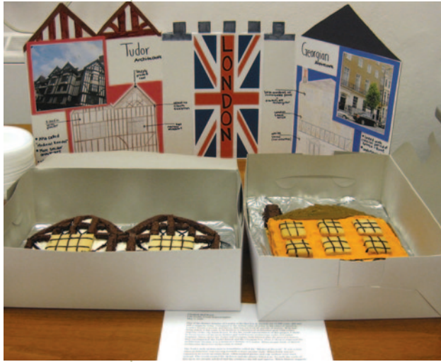
London's architecture is depicted in Georgian- and Tudor-style cakes.

three-dimensional model of the Colosseum in Rome), representative images that tell a story about the place (such as photographs of housing from different time periods in Moscow's