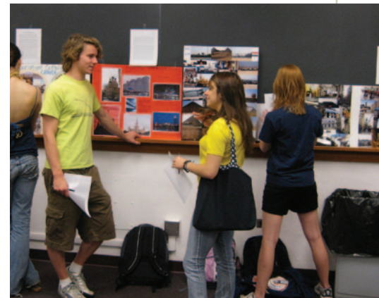
Students check out each other's presentations in the City Showcase.

The experiment was definitely a success. End-of-semester evaluations indicated that this assignment was very popular with the class. When asked, "What was the one thing you would not change about this class?" the most common response was the visual representation assignment. Students put a lot of thought and creativity into their work but also did a good job of relating their work to the themes of the class. This will definitely be an important component of "Cities of the World" in the future!