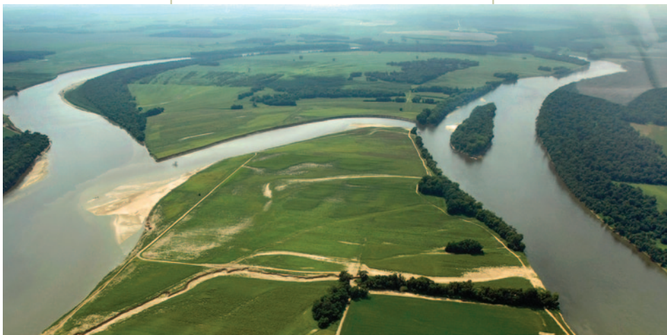
Cutoff channel (top) and gullies (bottom) across the neck of Mackey Bend.

the cutoff channel in a small airplane, the landowner and NRCS conservationist provided a wealth of information about the cutoff. They reported that the new cutoff channel had developed when water was out of bank for eight days in early June 2008. The carving of the new chan-