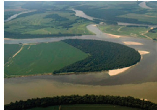
Confluence of Wabash and Ohio rivers showing Mackey Bend and the cutoff channel.