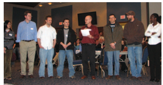
Geography students are recognized at the annual SESE Research Review.